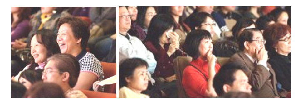
Audience responds to the Shen Yun performance in Taichung, Taiwan

(Clearwisdom.net) Shen Yun Performing Arts completed a seven-show run at Chung Hsing University in Taichung, Taiwan, on the evening of March 8, 2009. The Taichung audience was deeply impressed by the exquisite presentation, which brought China's divinely-bestowed culture to life.